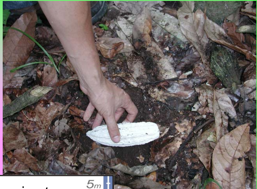
Pod left on ground